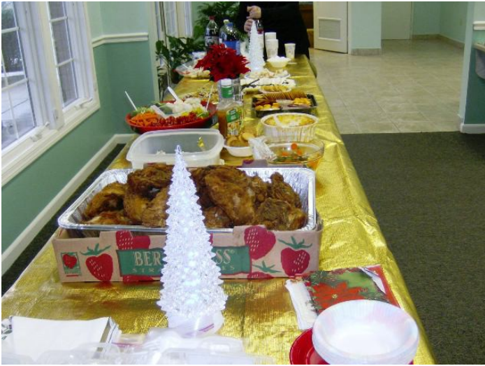
CHRISTMAS PARTY - THE MAIN FOOD BUFFET Thanks to all who brought food and desserts