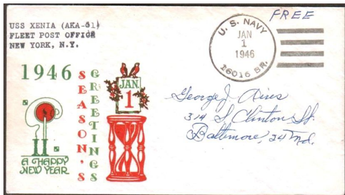
USS XENIA (AKA-51) COMMISSIONED 28-JULY 1945 DECOMMISSIONED 13 MAY 1946 (9 MONTHS LATER) U.S. NAVY JAN 1, 1946 16016 BR. POSTMARK

If at all possible try and come to one of our meetings and of course visit WILKPEX 2015 being held on April 18 th and 19 th .