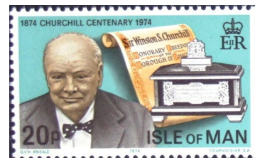
1974 ISLE OF MAN