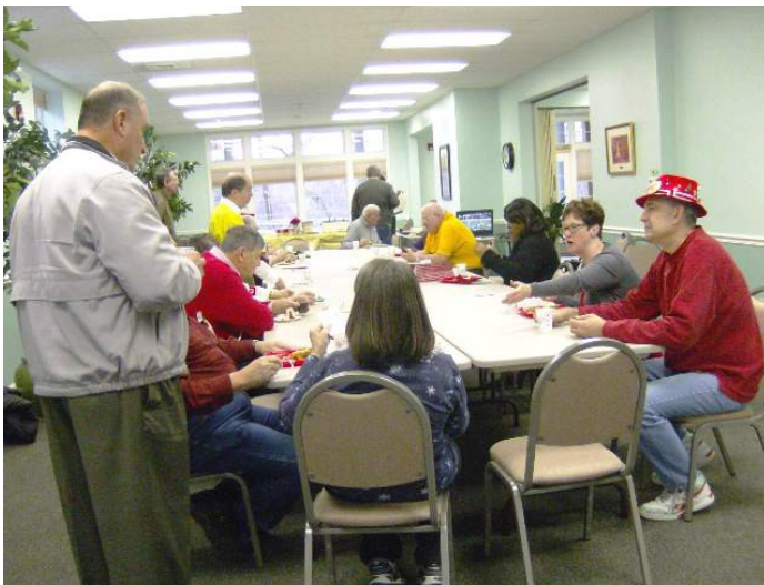
CHRISTMAS PARTY – EVERYONE IS PRETTY FULL Most of the attendees are in this “group shot”