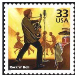
1999 ROCK 'N' ROLL